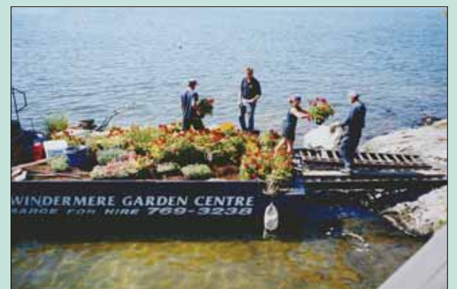
BARGE DELIVERY: Landscape crews unload plants from the Windermere Garden Centre barge. Delivery of products by barge is popular in Muskoka where cottagers and residents have gardens on their islands.