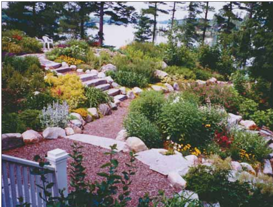
LANDSCAPE CONSTRUCTION by Windermere Garden Centre crews is featured at cottages and homes throughout Muskoka.