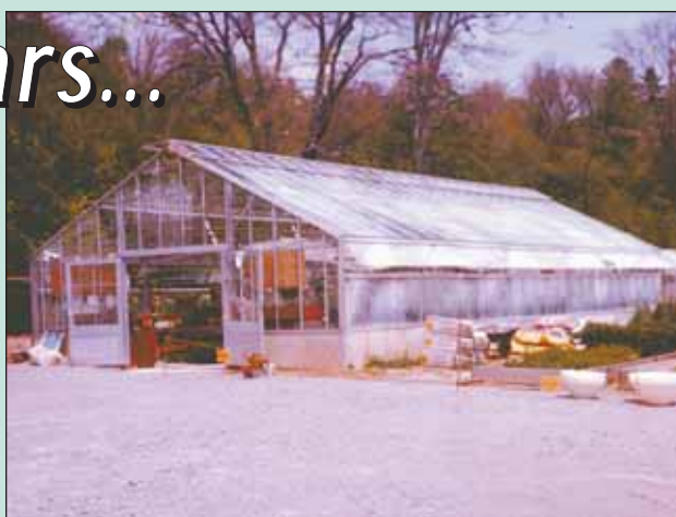
1977: The garden centre's first glass greenhouse was built so horticulturalists could grow plants all year long.